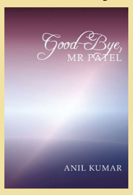
Goodbye Mr. Patel Hard Cover & E-Book